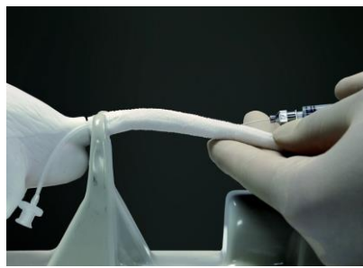
Tail vein injection Blood collection through tail vein