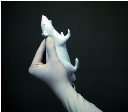
Retention / Holding